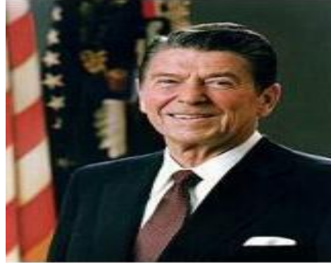
Ronald Reagan U.S. President 1981-89

USA could borrow from the world because of Dollarisation .