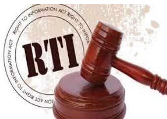
CLINICS RTI Clinic Accounts & Audit Clinic Charitable Trust Clinic