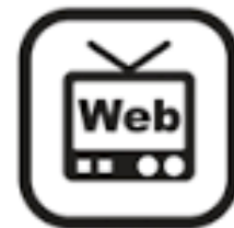
Web TV Missed an event, watch it here