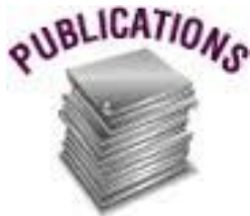
PUBLICATIONS Solution for Professionals