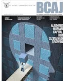
JOURNAL Monthly dose of analysis and updates