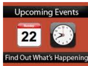
EVENTS Learn from the experienced peers