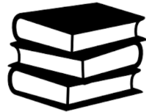
LIBRARY Universe of Knowledge